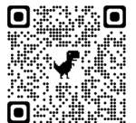
Exhibit Tip Sheets | 4-H Youth Development ( iastate.edu )

Exhibit Tip Sheets are another resource volunteers can utilize to help youth in their project area learning. The Exhibit Tip Sheets provide information for youth preparing for the exhibit judging experience, what to be prepared for and how to share learning gained through the exhibit with the judge.