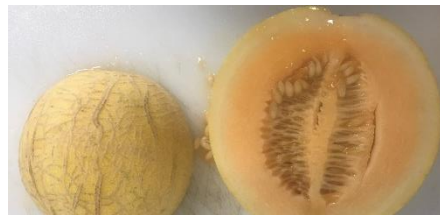
Figure 1. Melon cultivars used in the high tunnel specialty melon cultivar trial at the ISU Horticulture Research Station, Ames IA 50010.