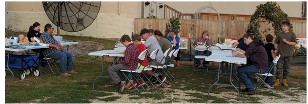
2022 Fall Festival

Thank you to all who attended the 2022 Fall Festival.