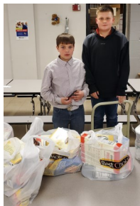
Clutier Cowboys and Cowgirls prepared gifts for the North Tama School.