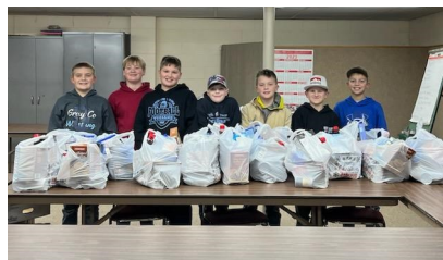
Toledo Techs prepared gifts for the South Tama School.