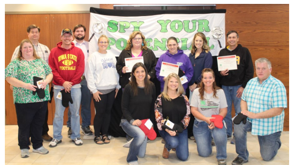
Our amazing 4-H leaders!