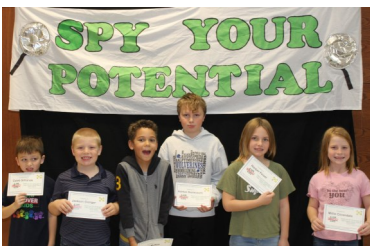
Clover Kids recognized for participation!

A big thank you to the 9-12th grade County Council for all their help with set up, reading and presenting awards and clean up. This event is possible because of their hard work and leadership!