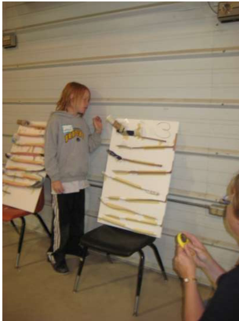
Caressa testing out their marble maze