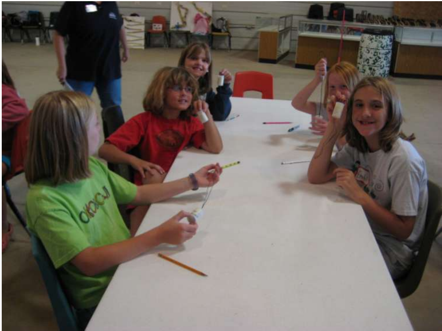
Making “First Aid Around Your Neck” kits