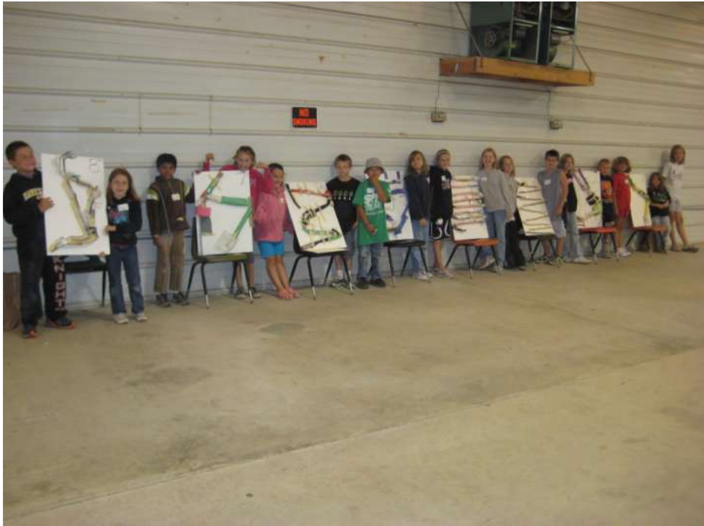
The whole group with their marble mazes