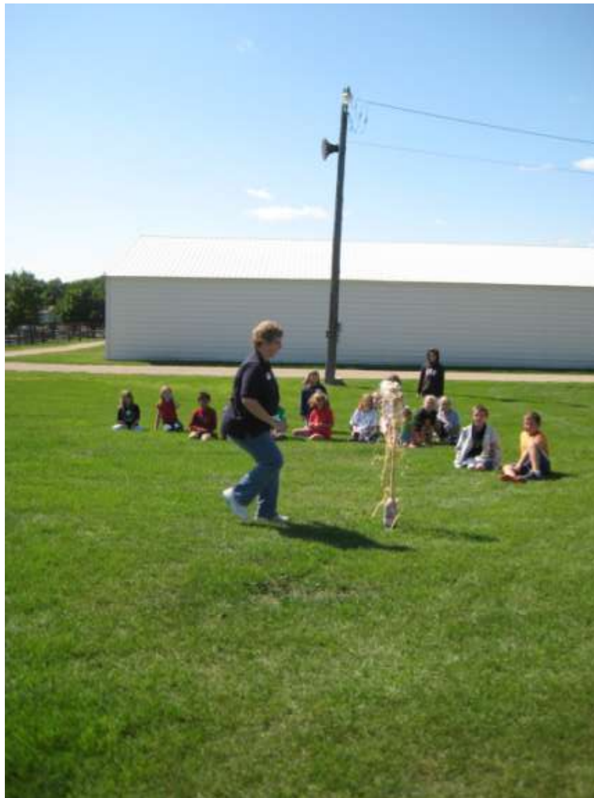
The second Diet Coke/Mentos experiment