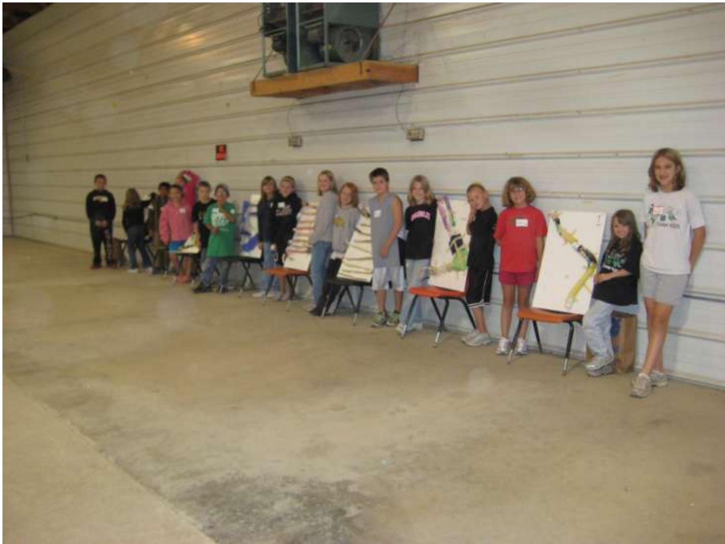
The whole group again