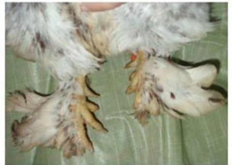
Legs & Feet