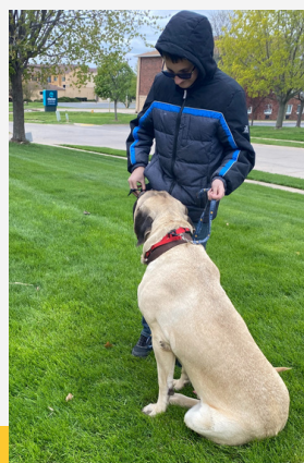
Scott County Dog Project at the Extension Office Native Plant Garden

I keep a very busy schedule, so it is important that I have to opportunity to plan in advance. sreyesa2024@gmail.com