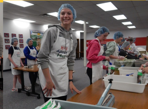
Heartland Hoofbeats April Service Project