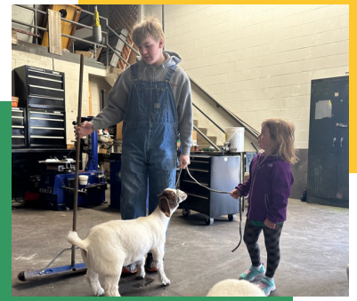
Weigh in at North Scot High School

Link to Helpful Information here . Leaders advise printing out your certificate after completing in person or online training and keeping it with your health papers. Then it will be ready to use for Fair Entry. A screen shot works if you don't have a printer.