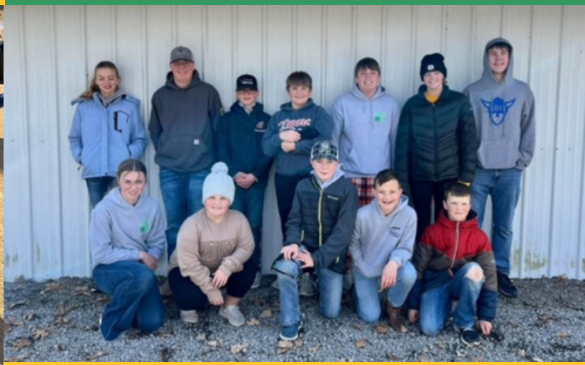
The Liberty Club Egg Hunt Organizers