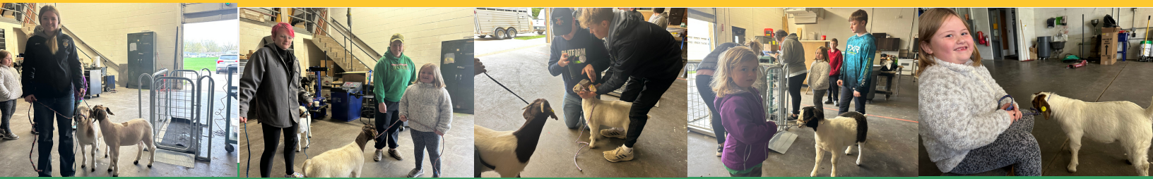
Sheep and Meat Goat Weigh In at North Scott High School