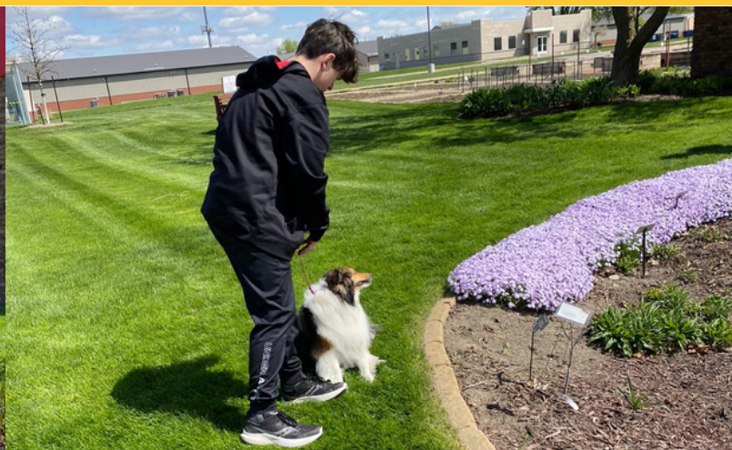
Scott County Dog Project