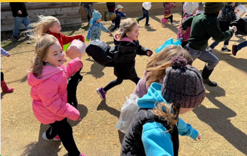
The Liberty Club Egg Hunt