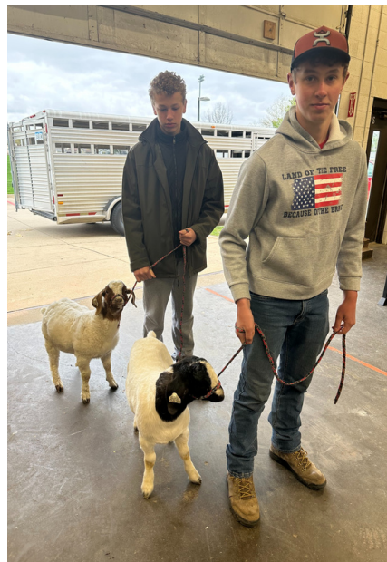
Weigh In at North Scott