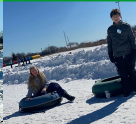
Heartland Hoofbeats at Snowstar