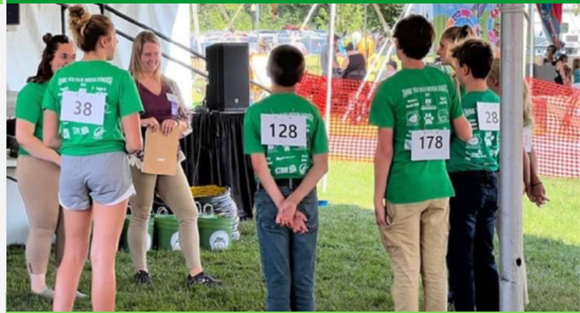
Dog Show at the Mississippi Valley Fair 2022

If you are interested in this opportunity visit this site for more details and an application form. Entries must be postmarked by March 15, 2023.