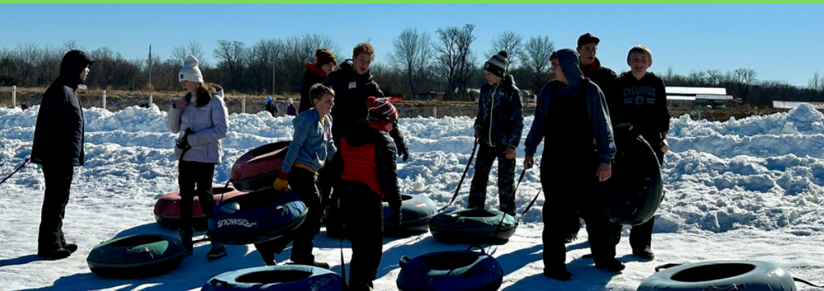
Sheridan Sluggers at Snowstar