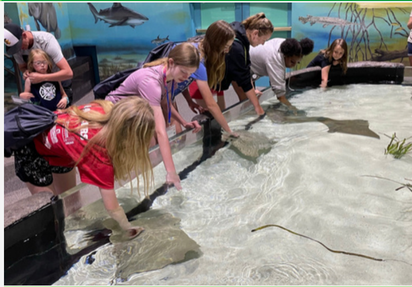
Mystery Tour to National Mississippi River Museum