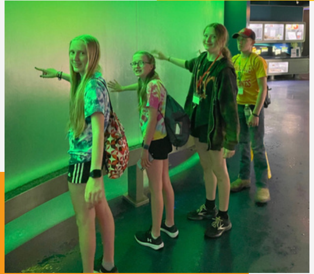
Mystery Tour to the National Mississippi River Museum