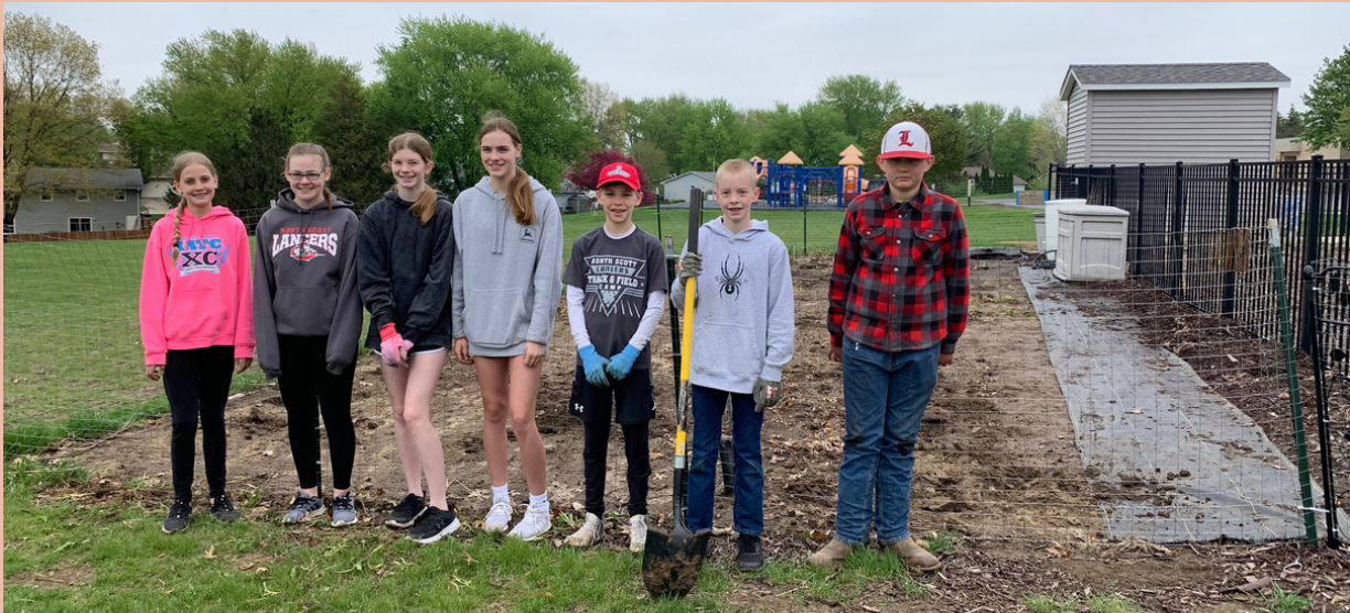
Lincoln Sheridan Club School Garden Project