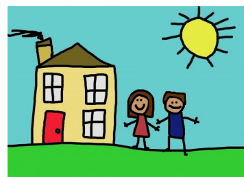
Draw a Picture