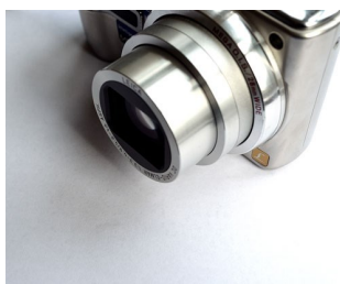
Take a Picture