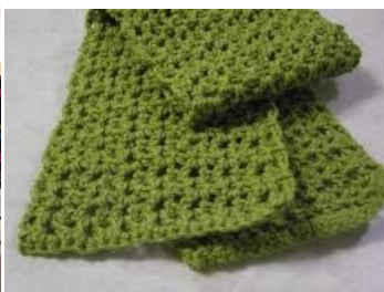
Crochet or Sew