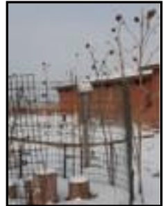
Snow on sunflowers in the Children's Garden.