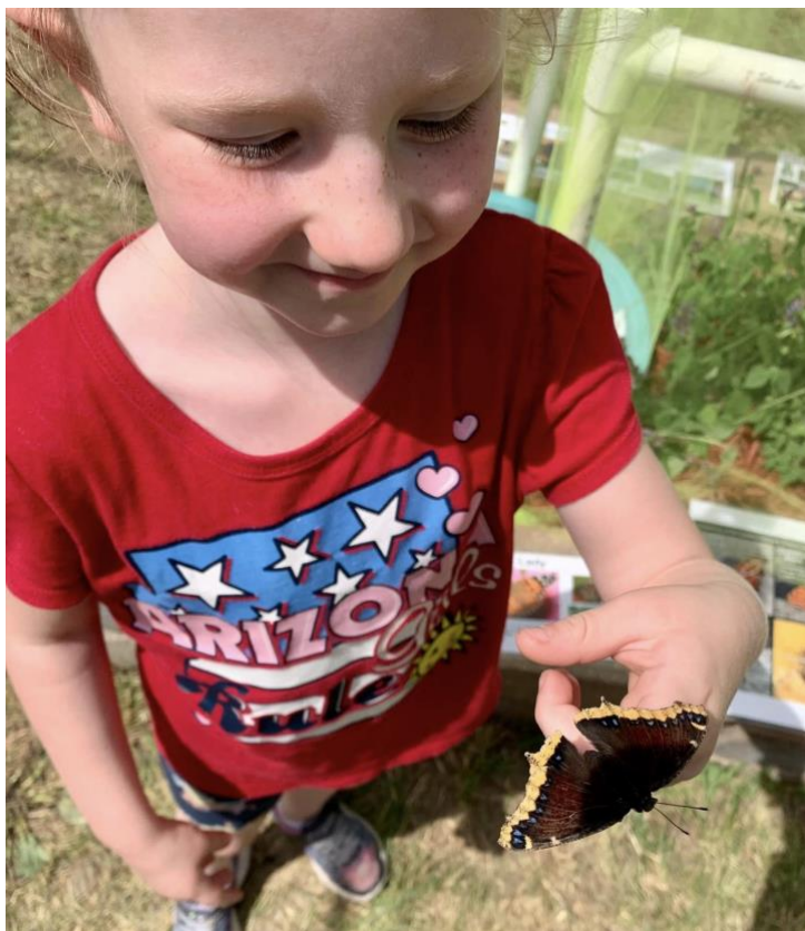
Child enjoying the lepidoptera at Butterfly House