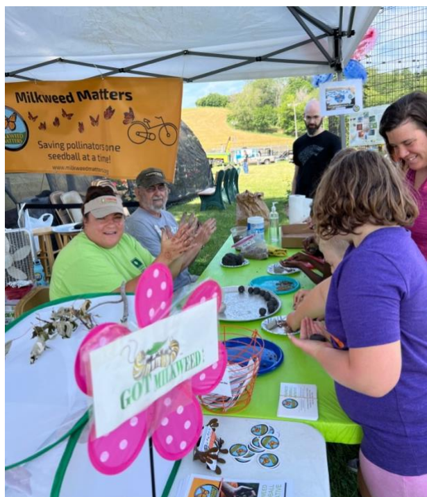
Seed ball table at the JC Fair 2022

Each fair's ending is always highlighted with the release of hundreds of butterflies before a large crowd of cheering spectators. It is also the signal that Johnson County MG volunteers can enjoy a well-deserved rest before the next family-oriented activity centered on environmental education.