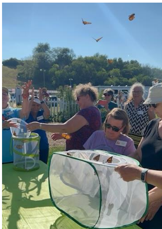
Butterfly release at this year's 4-H Fair 2022!!