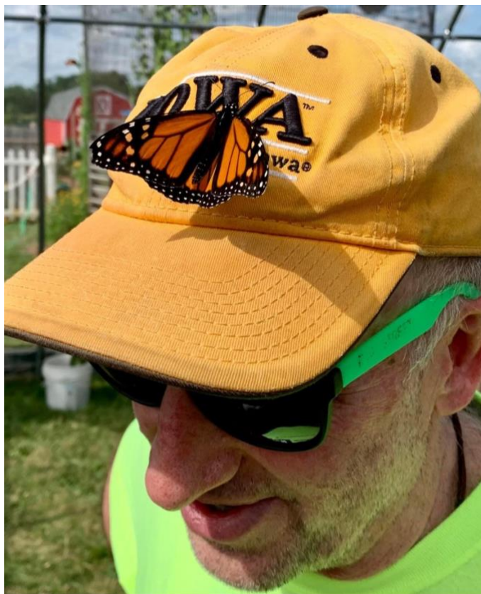
Monarchs love Iowa!

Each fair's ending is always highlighted with the release of hundreds of butterflies before a large crowd of cheering spectators. It is also the signal that Johnson County MG volunteers can enjoy a well-deserved rest before the next family-oriented activity centered on environmental education.