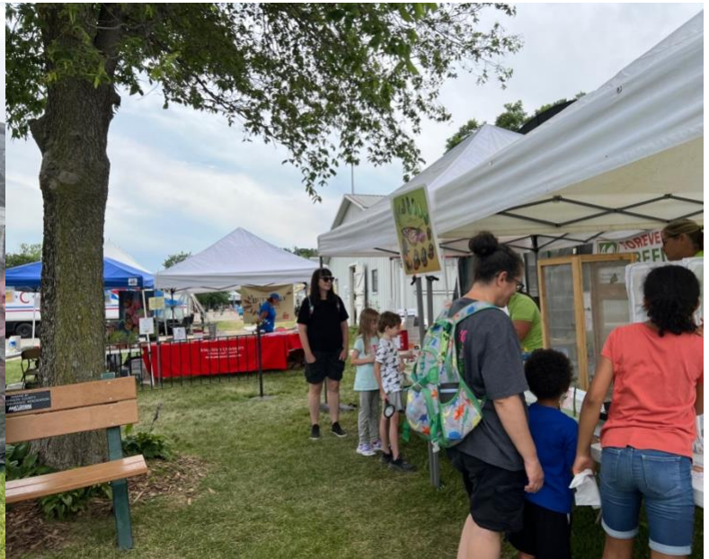
Exhibit tents for Butterfly House at JC Fair 2022

In 2022, over four fair days, more than 6,200 people attended the exhibit. The exhibit was staffed by 42 Master Gardener volunteers and the Murphy and Hershberger families and staff. Multiple shifts are needed to cover the 8-hour-plus days that the exhibit was open to the public.