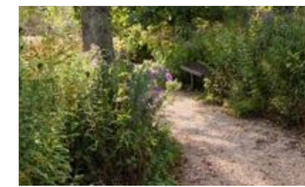
Modern Farm Welcome Center: www.417mag.com/417-Magazine/August-2014/Eclectic-Urban-Farmhouse/