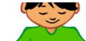
Draw a picture