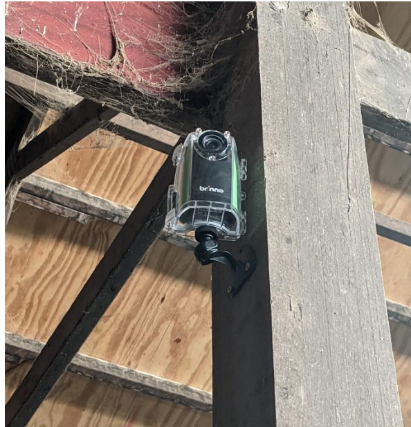
Brinno BCC100 time lapse camera package with protective case and adjustable swivel wall mount.