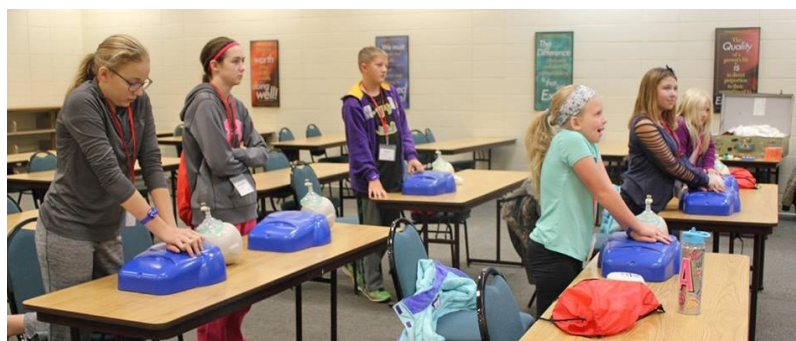
Youth learn the basics of CPR and First Aid at STEMfest: Healthy Living 2017.