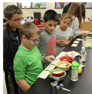
Participants focus on healthy eating and nutrition during STEMfest: Healthy Living.

Workshops included: CPR and First Aid Basics, Heart Monitors, Kids in the Kitchen, Yoga, Zumba, Healthy Mathematics, Nursing basics, Incredible Wearables, and more.