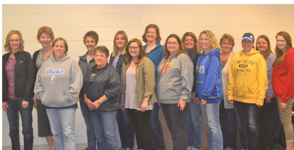
Annie's Project graduates pose during their six and final session.

Fifteen women participated in and graduated from this Annie's Project program which was hosted at Northwest Iowa Community College in Sheldon.