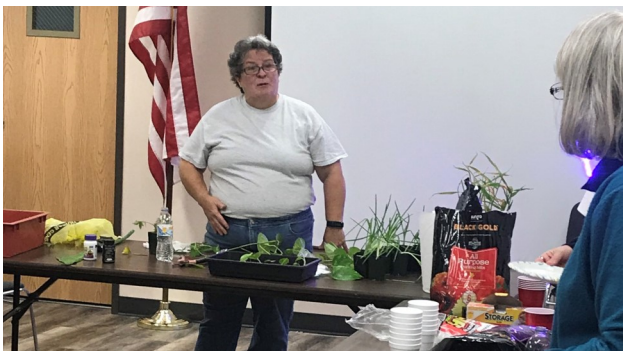
A key part of the Master Gardener flipped classroom was guest speakers as shown above and to the right.