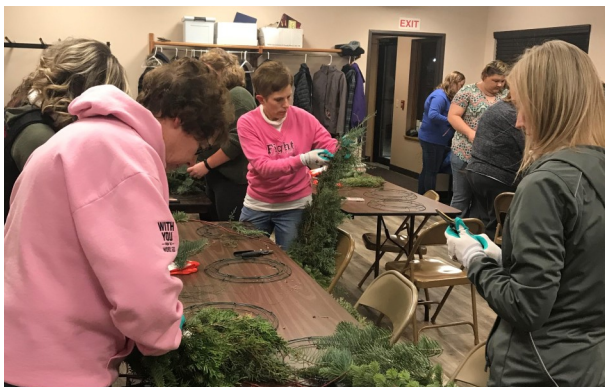
Participants gained hands-on experience and knowledge while designing their own holiday wreath in November.