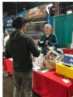
QCCA Flower and Garden Show