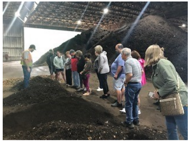
Scott County Master Gardeners tour the Master Gardeners

Just as the name of the event implies, participants were treated to a daylong excursion without knowing where they were going. A few days prior to the trip, parents attended a required meeting at which they were provided the day's itinerary with instructions not to share with their children. Departing on a charter bus from Eldridge at 7:15 a.m., the first stop was Four Mounds Inn & Conference Center, an outdoor recreational area in Dubuque. Four Mounds is home to high and low ropes courses and a rock-climbing wall. Youth practiced communication and leadership skills while taking part in lots of teambuilding activities with staff from Team Building Blocks of Dubuque. From there, the group traveled to the National Mississippi River Museum where a STEM program was presented on reptiles and amphibians followed by a self-guided tour. Crystal Lake Caves outside of Bellevue was the next destination. Youth received a guided tour of the cave and an educational presentation by their staff. Everyone enjoyed some social time while relaxing and playing UNO, bags, volleyball, and soccer. The last stop was Off Shore Resort in Bellevue for a delicious dinner overlooking the Mississippi River. The trip concluded at 8:00 p.m.