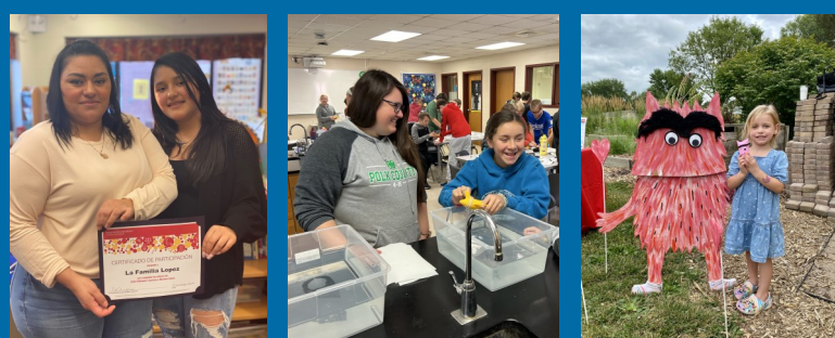
Throughout 2022 ISU Extension and Outreach in Polk County served Iowans by supporting families through Familias Fuertes (left), engaging youth through 4-H programs and projects (center), and encouraging mental health breaks by visiting one of the Polk County Master Gardeners three demonstration gardens (right).

Our dedicated Extension professionals delivered research-based education to thousands of Polk County residents in 2022 and we can't wait to serve more! Polk County Extension is the reliable resource to help residents move from recovery to success!