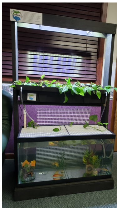
Left: Ioponics 40-gallon fish tank located at the Extension Office, includes five Koi fish and plants in a microecosystem. Top right: 4-H Outreach visit to local elementary classroom where students were challenged to think like engineers while building Lego structures and sharing. Bottom right: Teale, AmeriCorps Member, working with BeeBots in a local Kindergarten classroom.