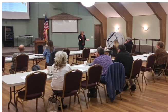
Local small business owners participating in the Financial Analysis Workshop in Mahaska County.

During the height of the pandemic, Mahaska, Marion, and Jasper Counties took the unprecedented step to work together to fund a Community and Economic Development (CED) Coordinator position. This position focuses on positively impacting small business in three key areas: