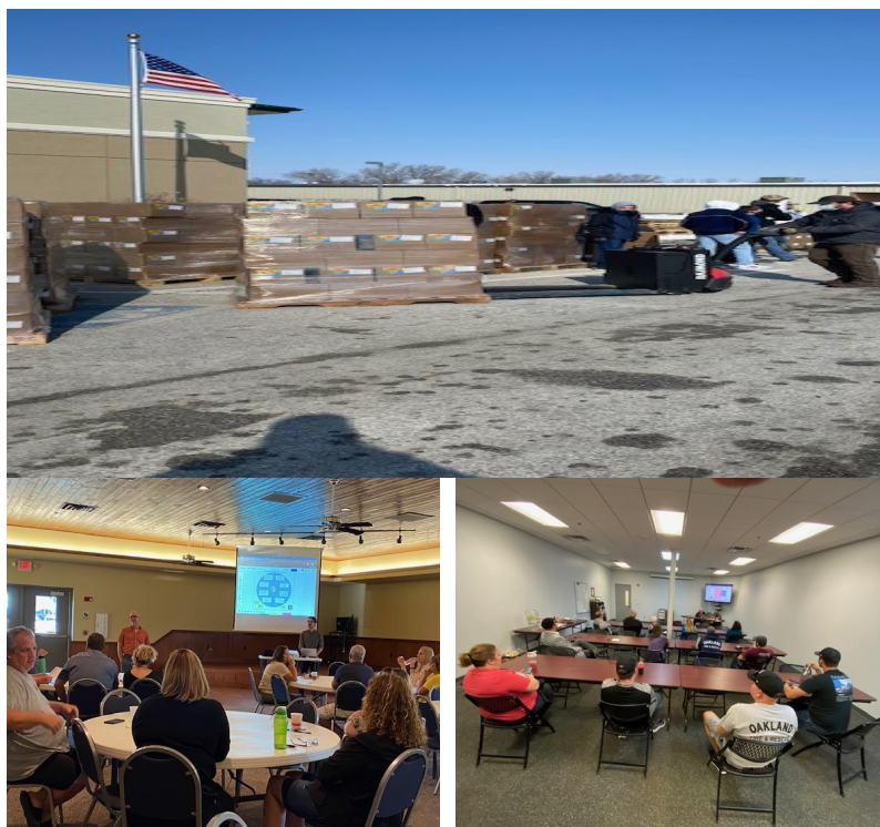
Top Picture—Distributions of the Farmers to Families food boxes at the Oakland Community Center.