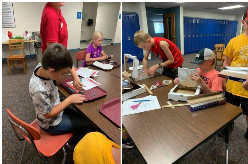
Photo (L): Students dissect a solar landscape light to see how it works. Photo (R): Youth create solar ovens to make their afternoon s’more snacks.

Seven middle schoolers from Franklin County attended the All Things Solar day camp Wednesday, August 11 at Hampton-Dumont Middle School in Hampton. Students learned how the sun’s energy runs a solar oven to toast a s’more and how it makes a solar landscape light work. They also created a sun clock to tell time and an art project using sun-sensitive paper. A guest speaker from Franklin Rural Electric Cooperative shared knowledge of solar power as well. This summer program, pictured top right, was led by Iowa State University Extension and Outreach Franklin County staff.