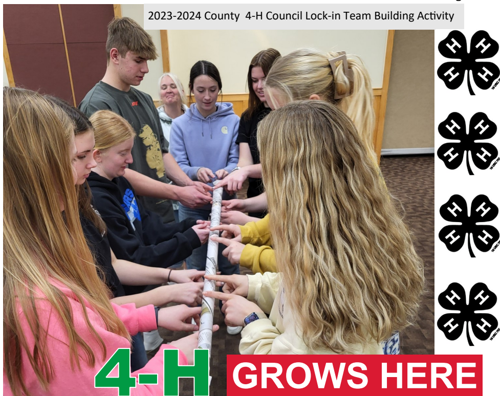
2023-2024 County 4-H Council Lock-in Team Building Activity