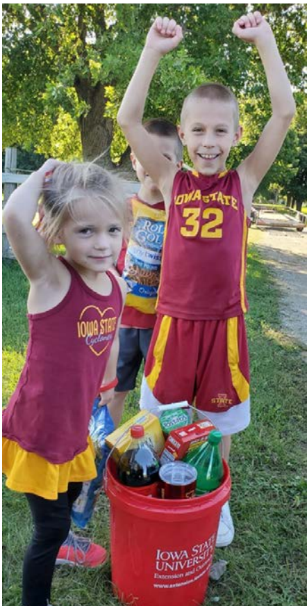
Successful Sac County scavenger hunt!