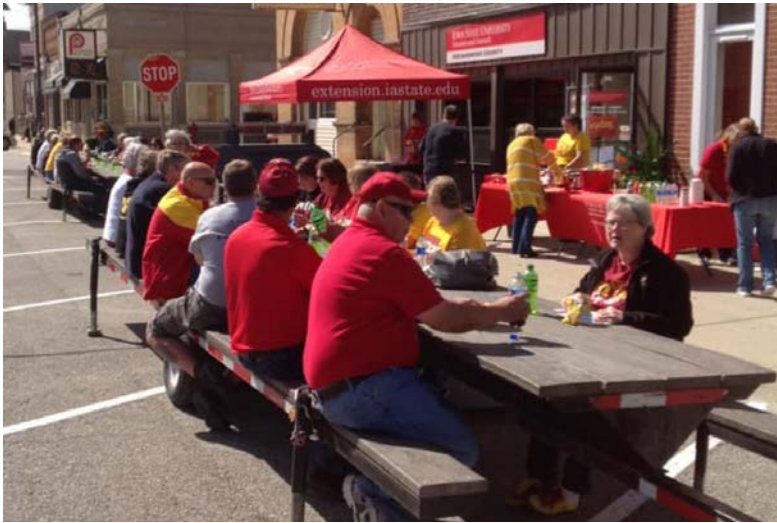
Pocahontas County served 120 hot dogs at their tailgate party.