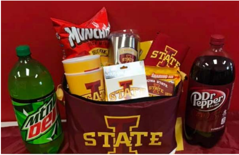
Ida County Facebook gift basket drawing.