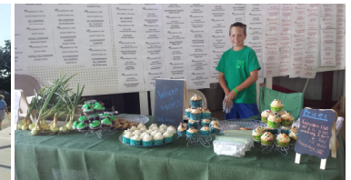
Jr. Farmers Market