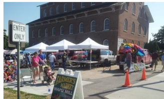
Independence Farmers Market