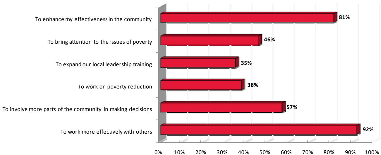
ALDEN [N=37] INTENTIONS TO PUT LEADERSHIP SKILLS INTO ACTION

At the conclusion of the training, participants were asked to identify ways the leadership training had helped them and others to address poverty in Alden. The next chart reports the views of Alden participants and those in all 14 Iowa communities that are participating in the 18-month Horizons program. Momentum for community action is building. The majority (68%) agreed that more people are aware of poverty. About 2 in 3 (65%) said the community is discussing poverty and what to do about it, and half (49%) observed more people stepping up to assist those in poverty.