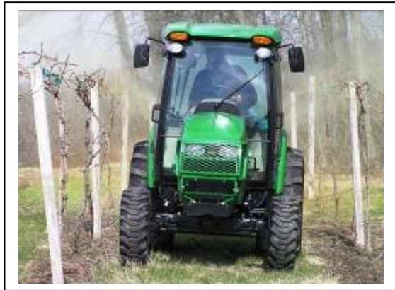
(Above) David shut off all but the top two nozzles on either side of sprayer to direct the liquid lime sulfur onto the cordon.