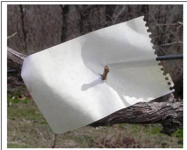
(Left) There are special water sensitive spray paper cards that turn color where droplets hit them. This helps to calibrate an air blast sprayer to attain better coverage. Placing common white pieces of paper along the cordon can also provide this same information if looked at quickly after an application. Many of the pesticides we apply will discolor the paper where the spray droplets land. A small amount of spray colorant can also be used to enhance this effect.