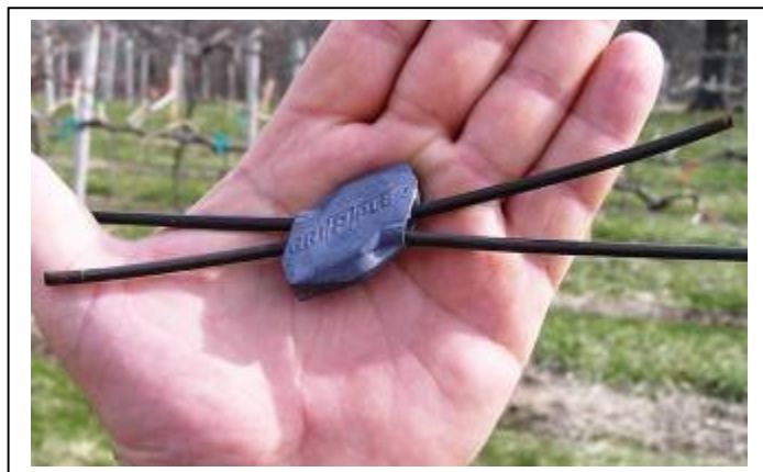
(Right) A Gripple can solve a high tension wire problem very quickly. They are easy to use and fairly inexpensive. The 12.5 gauge size costs approximately $1.50 each.