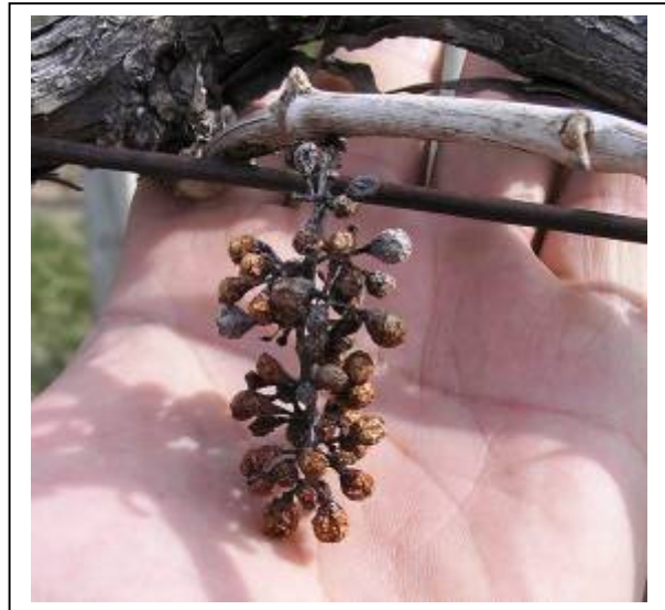
(Above) Marechal Foch cluster left over from last year. These dried up mummies can harbor all the major diseases you don't want in your vineyard. Best to pull off and discard prior to bud break.