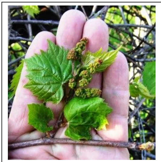
Newly emerging flower clusters of wild grape ( Vitis Riparia ) 5-14-08, Indianola, IA