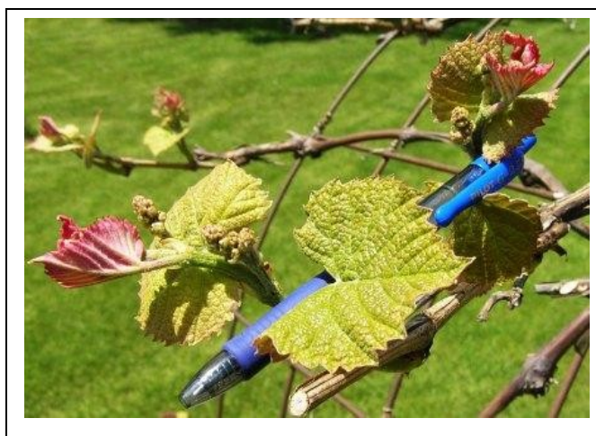
Newly emerging flower clusters of Concord 5-15-08, Indianola, IA