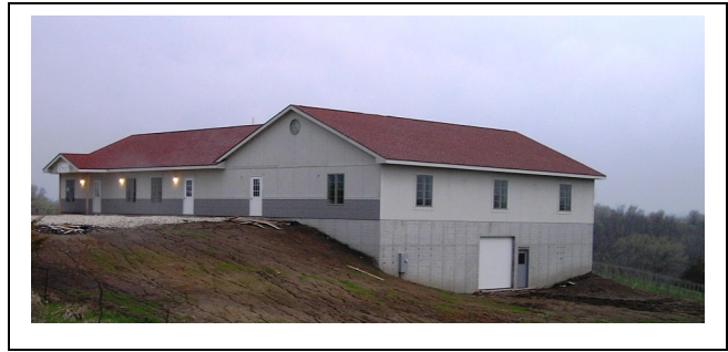
Two Saints Winery's New 4,800 Sq. Ft. Winery Not quite finished yet, but getting close. http://www.twosaintswinery.com/