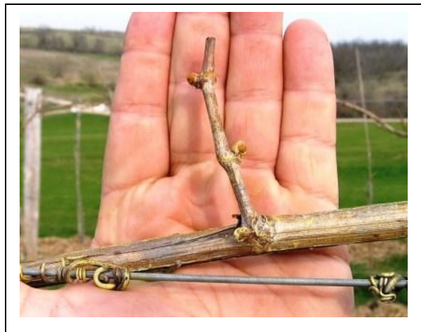
4-23-08 Marechal Foch buds just beginning to swell after a Liquid Lime application at Grape Escape Vineyard, Pleasantville, IA