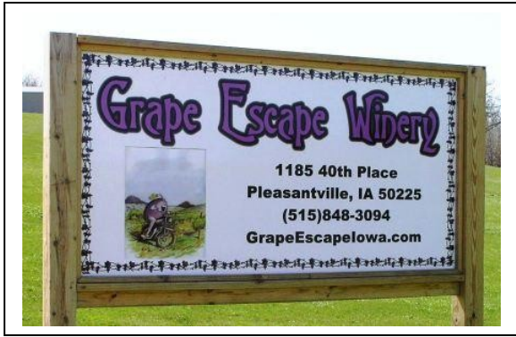
Grape Escape's New Sign http://www.grapeescapeiowa.com/