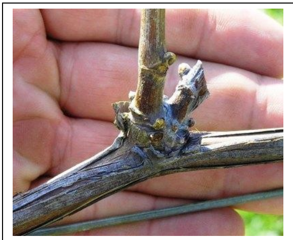
4-23-08 LaCrosse buds just beginning to swell after a Liquid Lime application at Grape Escape Vineyard, Pleasantville, IA Note all the basal buds at base of spur.