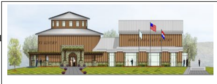
Diagram of the New Mount Winery at Branson, MO

Mount Pleasant Winery located in Augusta Missouri is scheduled to be opening a winery in Branson in March of 2008. The new 9,200 square foot winery will be located on 2 acres of land. 3,000 square feet will be for retail space, 1,500 square feet will consist of wine tasting rooms and over 2,500 square feet will be common areas.