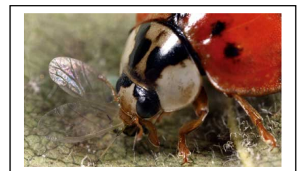
MALB eating soybean aphid.

ISU Extension agronomists are starting to report economic infestations of soybean aphids in soybean fields. Brian Lang, our Extension agronomist in Decorah started to see infestation levels of over 400 aphids per plant on July 5 th . Populations of 250+ aphids on 80% of the plants and increasing is considered the economic threshold for treating with an insecticide. 2003 was the big outbreak year that everyone remembers with another significant year in 2005. So what does this mean for a grape grower? Multicolored Asian Lady Beetle (MALB) populations tend to increase in proportion to the soybean aphid population. MALB's love to move into vineyards when the soybeans