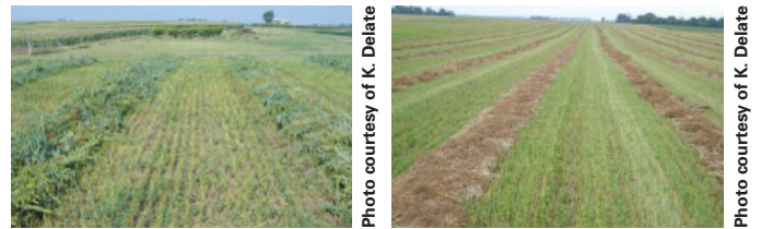
The best method for harvesting organic flax is to windrow the flax first with a swather, then use a pick-up combine after weeds have dried down from green (left) to brown (right) and the moisture in the flax in the windrows has decreased to at least 10 percent.

While flax does not shatter or lodge as easily as other small grains, follow additional harvest considerations in order to obtain the highest quality organic flax. Because herbicides cannot be used, and excessive green weeds in organic fields at harvest can interfere with combining, flax usually is windrowed and allowed to dry before combining. Combining without windrowing is only recommended for weed-free fields.