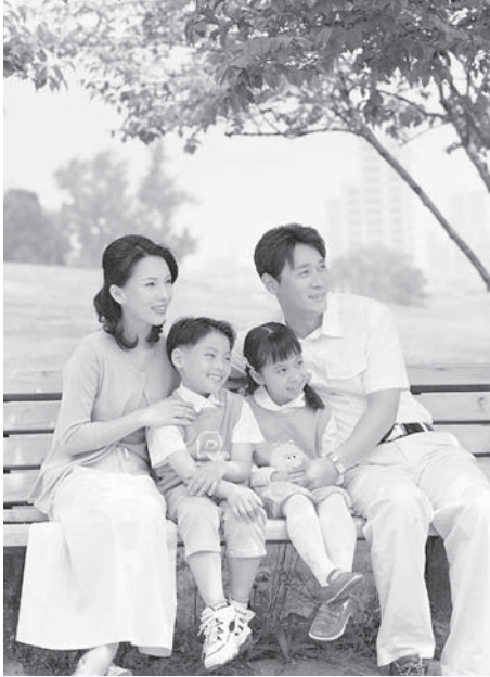
A will enables you to nominate a guardian for your minor children.

The extension publication Estate Planning, PM 993, discusses estate planning in more detail and covers more topics such as probate and federal estate taxes. It's available from the ISU Extension Distribution Center Online Store, www.extension.iastate.edu/store/ .