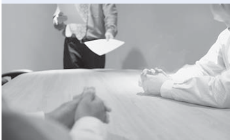
A will is a powerful estate planning tool.

In Iowa, wills must be in writing and signed by the testator (the person making the will). The signature must be witnessed by at least two disinterested parties. Witnesses are there to ensure that the person making the will appears to be of sound mind and isn't being forced