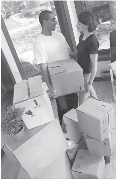
Joint tenancy gives the surviving owner immediate access to the property.