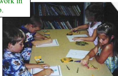
Helping at Jump Start for Kindergarten allowed me to work in the schools also.

When I signed up for AmeriCorps, I thought I was signing up for summer camp or daycare, but when I started, I realized how wrong I was. AmeriCorps is more than a summer camp or daycare: it is a growing experience for children and oneself. It is a rewarding experience when you see the smiles on the children's faces when you show up at the park, or the hug you received when you leave for the night, or when the children solve a problem on their own that occurs during a game or project. My AmeriCorps membership has made an everlasting impression on me and I will never forget the children, students, teachers, and staff I had the pleasure of coming into contact with and getting to know.