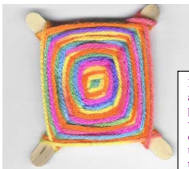
Making art projects was an everyday thing at the park.

Being at Comiskey and with the children everyday really taught me a lot about myself. It was through working with these young people that I learned the importance of early experiences, the value of a friend, and how curious young minds can be.