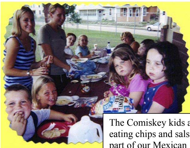
The Comiskey kids are eating chips and salsa as part of our Mexican Fiesta week.

Perhaps one of my most challenging placements this summer was working at Comiskey. When I first started there, I was very easily frustrated by the children and their lack of following directions. I went home many nights feeling like I was a mean person. As time went on, I could see that I was such an important person to the children, and that I was one of the only role models that they had.