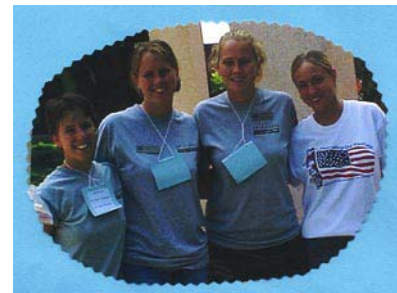
Myself and other Members at UD for Kids.

I feel so blessed to have been able to work with all the children, and I really feel that they will always have a place in my heart. The bonds that I have made with all the kids will never be forgotten, because as I was teaching them all summer, they were also teaching me.