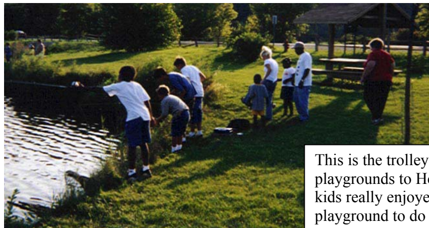
This is the trolley trip from the playgrounds to Heritage Pond. The kids really enjoyed getting off the playground to do other activities.

In the first couple of weeks, I wanted the summer to be over, already. I had re-occurring thoughts that I could not do what I was expected to do this summer. Then, something changed. Instead of wanting the summer to be over, I did not want it to end. I had a cognitive transformation. I wanted the summer to end because I had not connected with the children, but now, if the summer ends, I would lose my new friends. At first I was haunted by the notion that I needed to say something profound in order to influence the children. Frustration grew from my inability to find the right words. The frustrations subsided when I realized it was not the words, but just being with the children was the key. In being there with the children, they have given me an experience that I would never take back or change in any way. I thank them for all that they have given me.