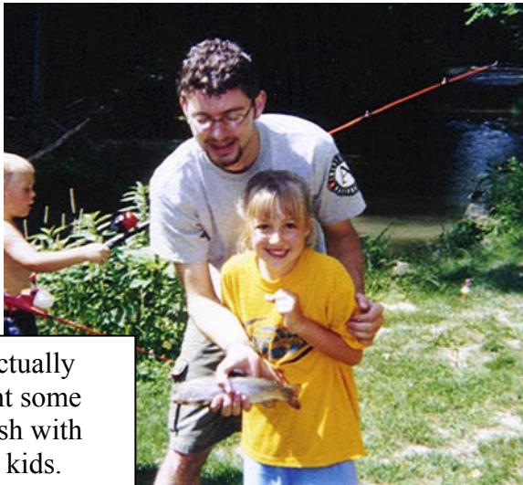
We actually caught some big fish with the Y kids.

I participated in Growing in the Garden, Fish Iowa, as well as Nature and Environment instructions at Fulton and Comiskey playgrounds. I led the children in activities involving nature. I did not expect the service to be so diversified. I thought that I would do one thing from eight to five, but in reality, some days went from nine to nine, and I would visit four or five different sites in the day.