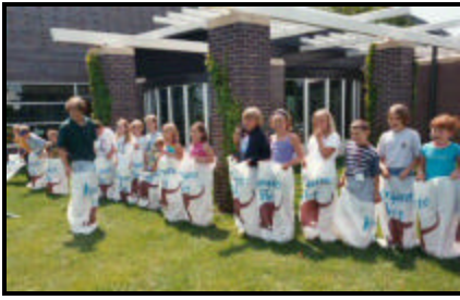
Outback 4-H day campers in Ankeny played kangaroo sack races as one activity to learn about Australia.