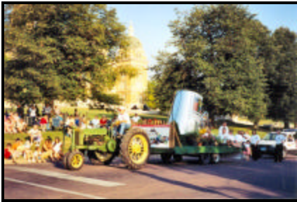
“100 years of Extension” was the theme of the Master Gardener float for the Iowa State Fair Parade. Polk County Master Gardeners used their Discovery Garden to educate fairgoers about landscape and gardening.