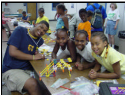
Extension staff teaches youth at the Grubb YMCA engineering concepts by building model bridges.