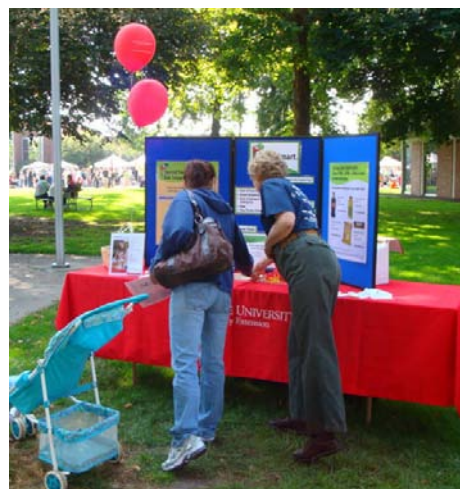
Spend Smart Eat Smart Display at Cedar Rapids Farmer's Market

Financial counseling for flood affected families was another important part of our ISU Linn County effort to help families manage these difficult times. With financial assistance from the City of Cedar Rapids we provided 320 counseling sessions to help families rebuild an after-flood budget, link to services, reclaim lost documents, and achieve stability.