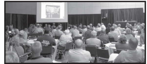
Wind Energy Conference