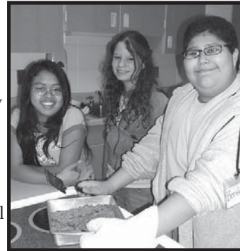
Kids a Cookin'

• Kids a Cookin' – After school and summer program for youth in all Woodbury County schools. Teaches fun methods of preparing healthy foods and increasing physical activity