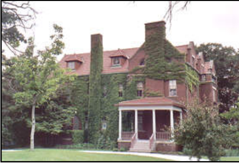
... Smeltzer House , from p. 3