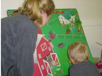
Farm Safety Pre-School