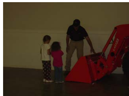
Farm Safety Pre-School

Page County Beef Weigh-in Livestock Country of Origin Labeling 4-H Night with the Lancers Girl Talk Babysitting Class Let's Cook State 4-H Recognition 2012 Materials Page County Swine Weigh-in State Recognition Interviews Calendar