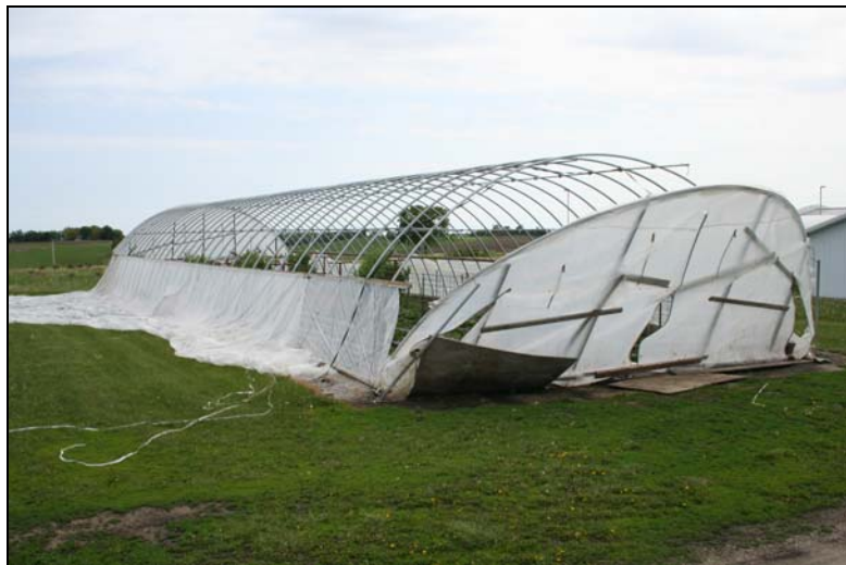
Figure 3. Wind damage to the high tunnel at the Armstrong Research Farm on May 25, 2008.