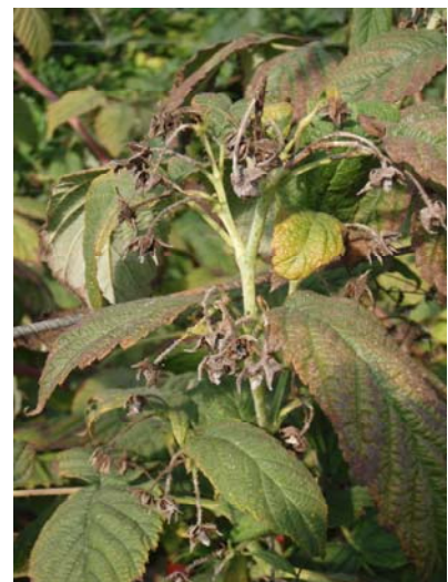
Figure 4. Botrytis fruit rot on Autumn Bliss raspberry blossoms and developing fruit.