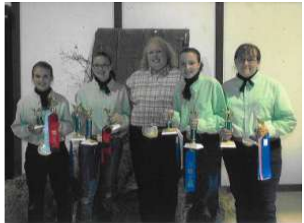
The Junior Team won first place!

** The team going to Denver is fundraising quickly for their trip coming up soon. They will be having two free will donation pancake breakfasts in Christy Hall on Saturdays December 6 and 20 from 6 am until 11 am. See you there!