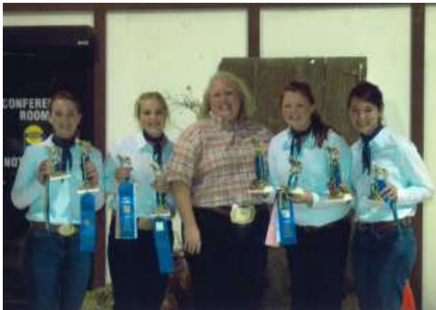
The Senior Team will be representing Story County & Iowa 4-H at the National 4-H Horse Judging Competition at the National Western Show in January in Denver, Colorado.

Both teams competed at the State 4-H Horse Judging Competition November 1 at Jester Park.