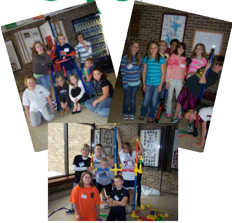
Okoboji Middle School Ricochet students building with Toobezes.