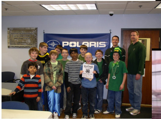
Wave Runner / Lego Clubs Tour Polaris