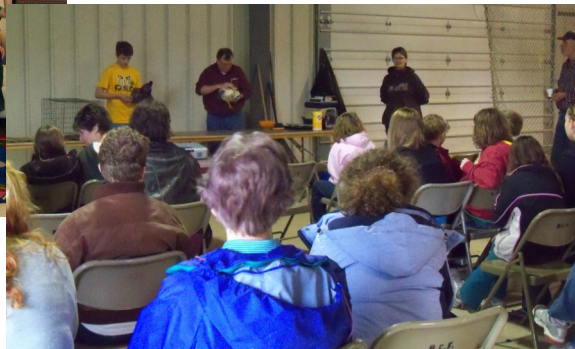
Poultry & Rabbit Information Party A Success