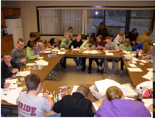
Milford Pioneers Club / Mighty Mack Service Project