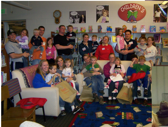
Silver Lakers 4-H Club Provides Childcare for Family Storyteller Program Series at Lake Park Public Library