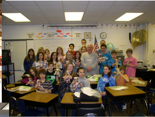
Ricochet Makes & Donates Military Hug Dolls