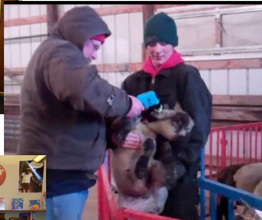
Volunteers Help With Sheep & Goat Weigh-in