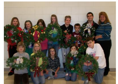
“Make & Take” workshop participants create holiday wreaths; learn design elements & art principles; and complete an exhibit for 2011 County Fair!

IOWA STATE UNIVERSITY University Extension