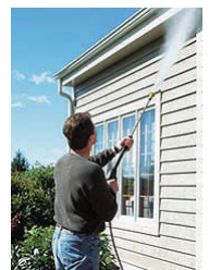
Cleaning the permanent siding.

Scrub the surface to be cleaned with a bristle brush or sponge, and then rinse with clean water. If you plan to paint let the surface dry thoroughly before you proceed.