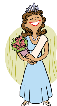
Exhibit Building Information

As in past years, the style show will be held in conjunction with the Fair Queen contest. The activities will be held on the afternoon of July 20th at the Exhibit Building. This event starts at 2:00 p.m.